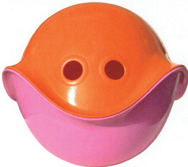
- 5 -