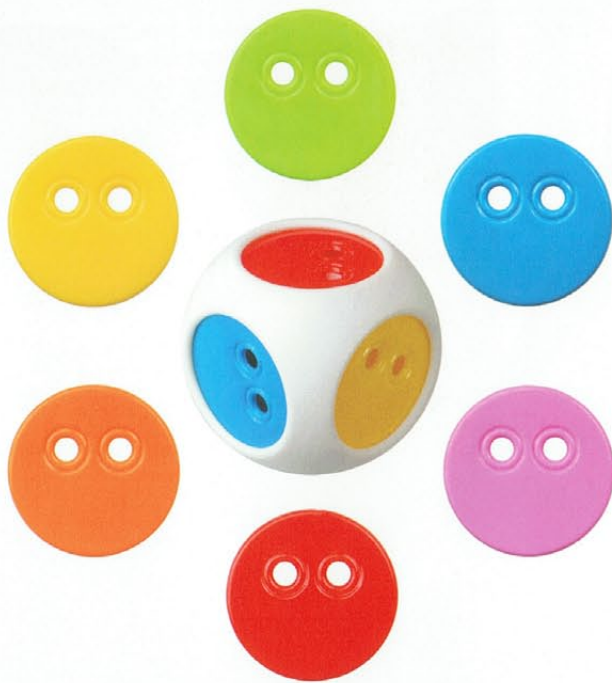
- 1 -