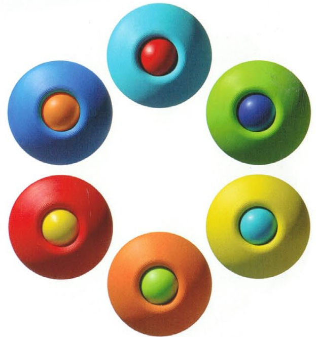
- 2 -