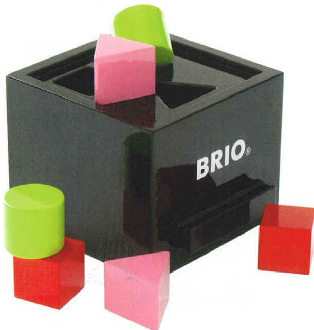
- 6 -